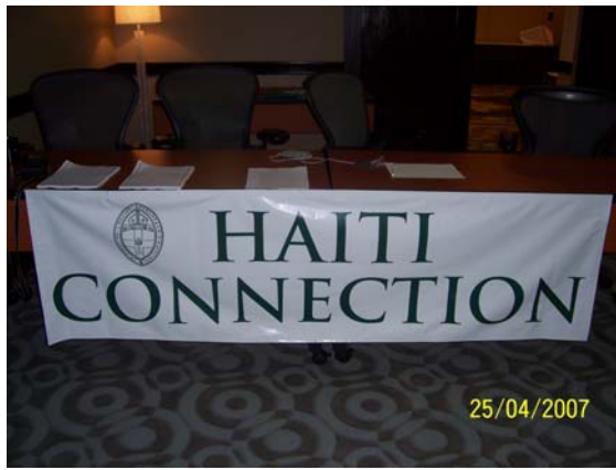
National Episcopal Haiti Meeting