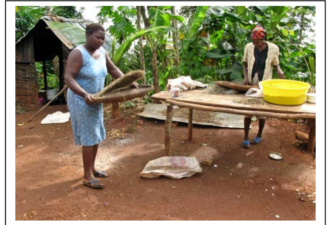
Winnowing and Cleaning Coffee in Jeannette